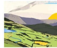
A New Green Revolution